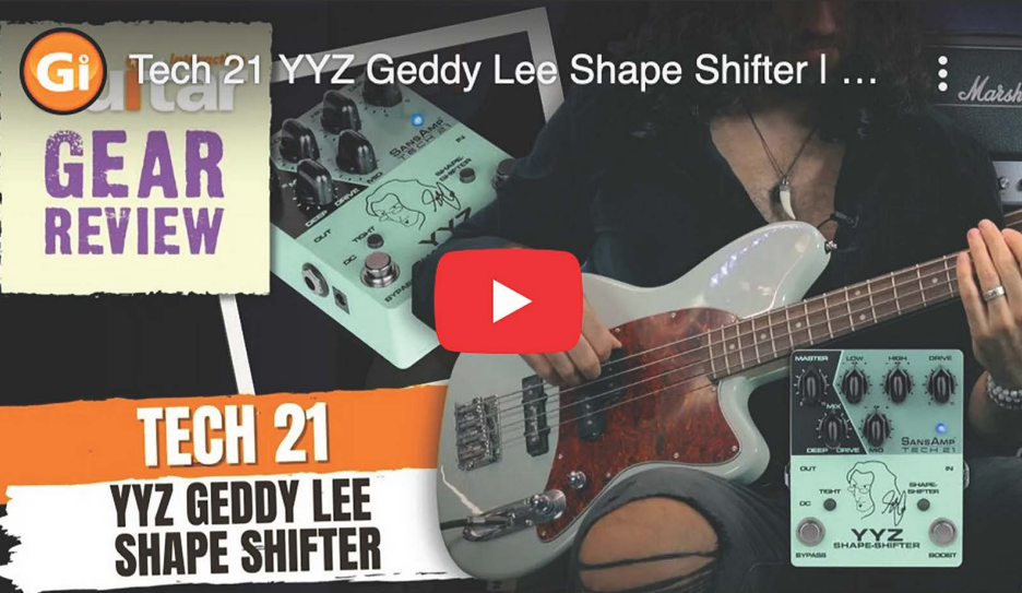
Tech 21 YYY Geddy Lee Shape Shifter

The Geddy Lee YYY Shape Shifter is an absolute Swiss army knife of rock bass tones in a compact package.